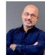
Roberto Cingolani CEO and General Manager, Leonardo, Italy